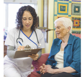
National Audit of Breast Cancer in Older Patients Part of the National Clinical Audit Patient Outcomes Programme 2017 Annual Report